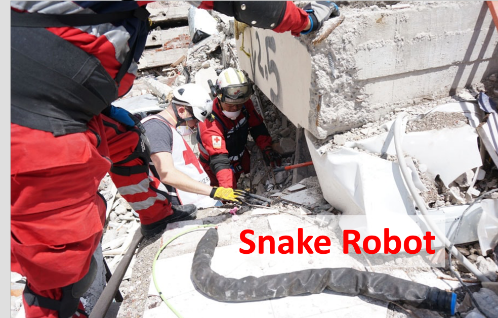
Mexico City Earthquake [12]