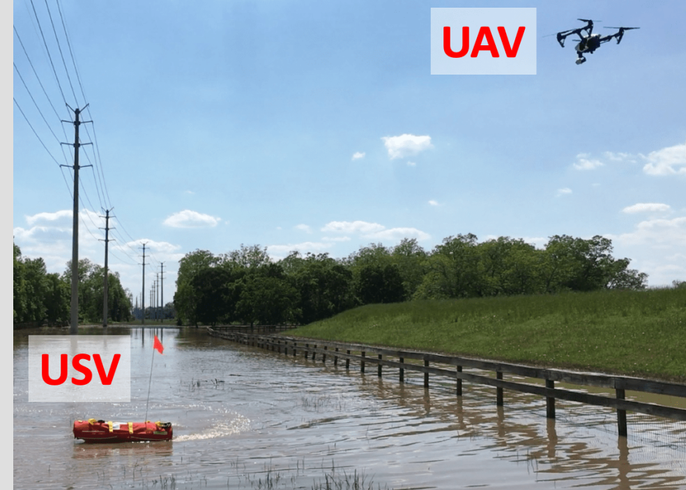
Hurricanes and Greece Refugee Crisis [9–11]