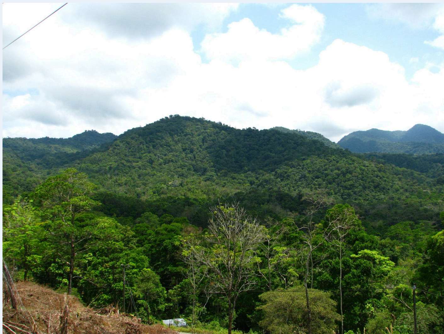
Expected terrain for deployment.

This system will aid in obtaining soil, water, and leaf samples from coordinated sites to ensure coverage, enabling spatially distributed collection in areas where it is currently too costly or dangerous.