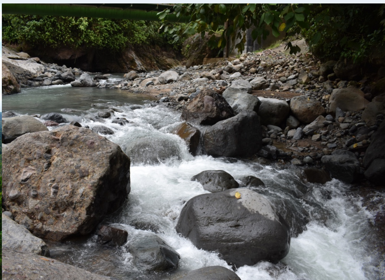
Example water collection site.