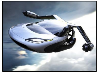
Rebirth of “custom cars” (autonomous flying ones)